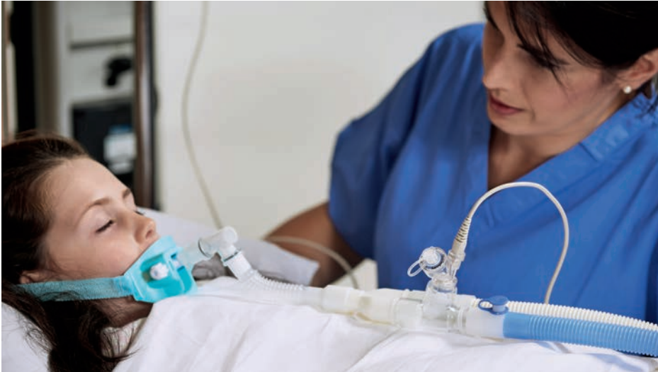
Aerogen's technology applied in patient care.