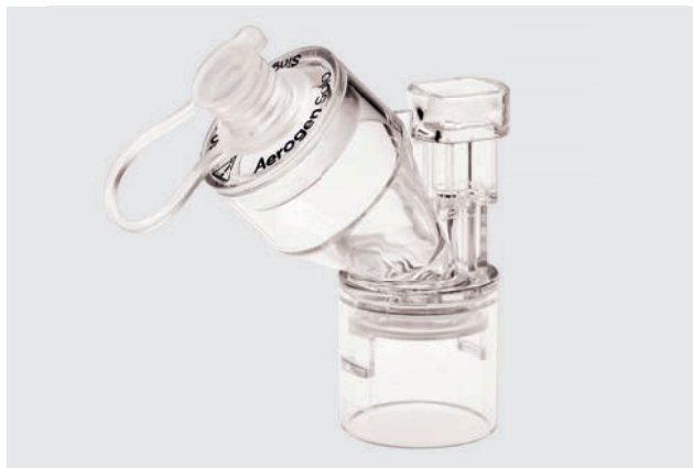
The Aerogen Solo Nebulizer is suitable for solutions, suspensions, proteins and peptides.